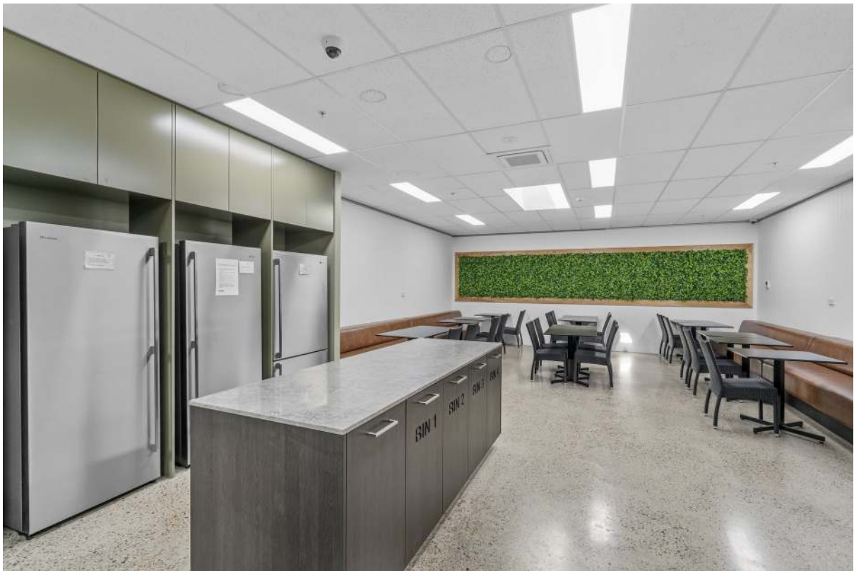
Dining & Kitchen area