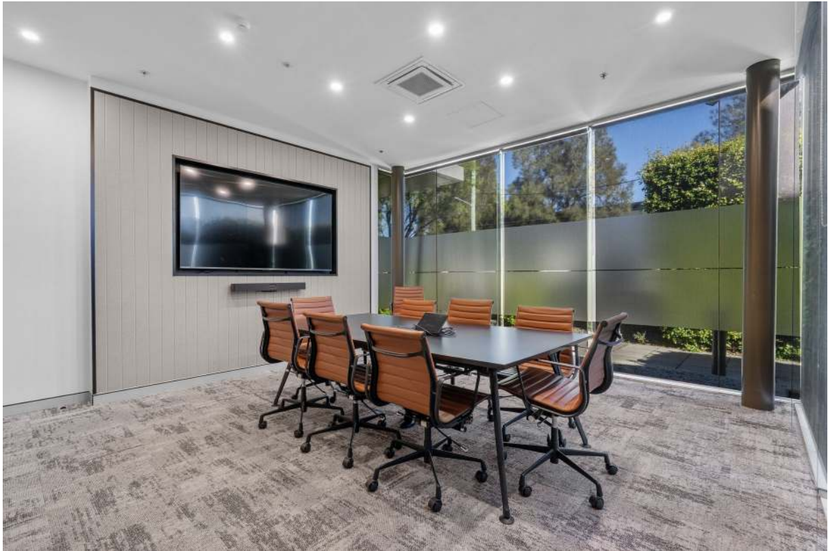
Meeting Room 3