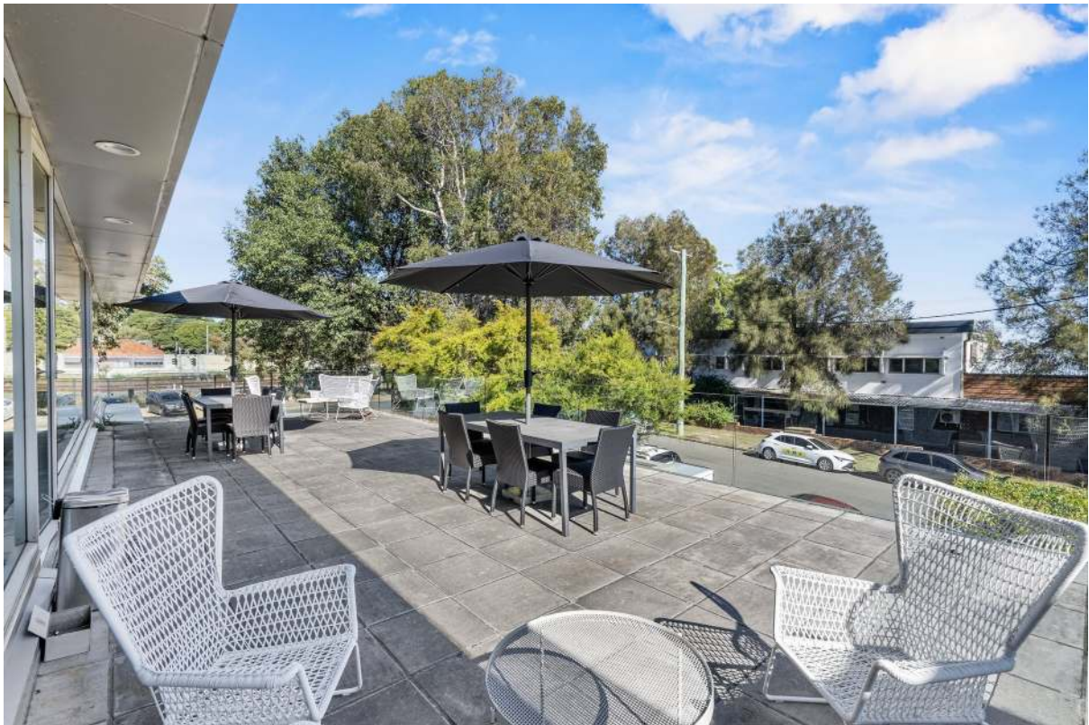
Outdoor terrace for dining and just relaxing