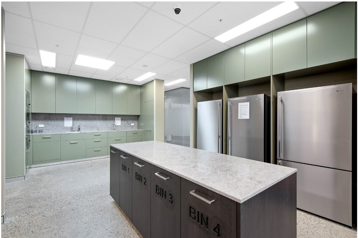
Dining & Kitchen area