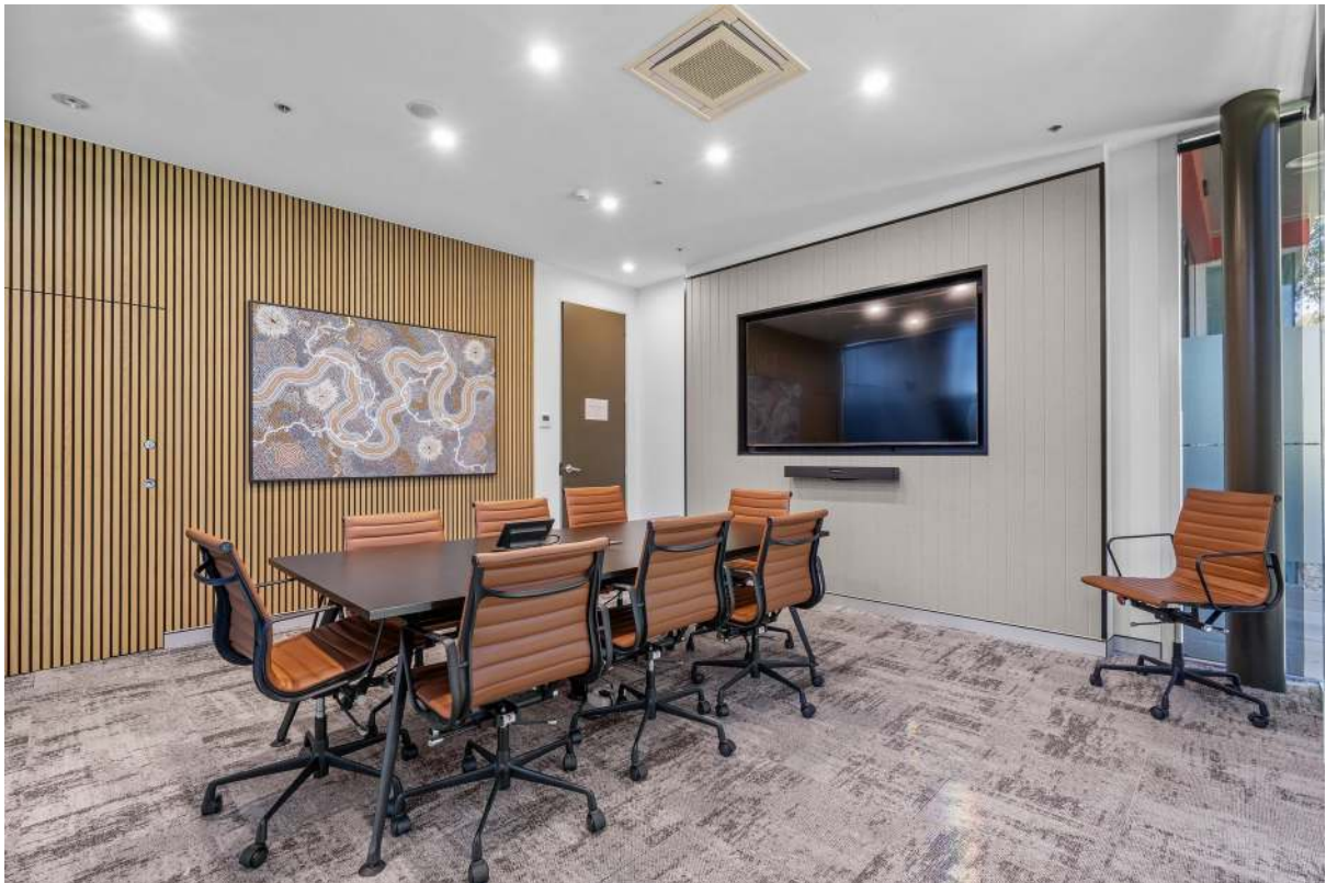
Meeting Room 3